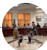
INTRODUCTION TO CBT