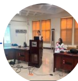
OVERVIEW OF DEPRESSION & ANXIETY