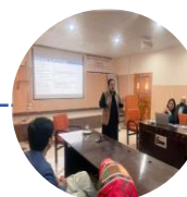
TB DOTS STRUCTURE & REPORTING