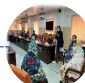
ROLE PLAY ON DEPRESSION