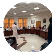
CONDUCTING FOCUSED ETHNOGRAPHY