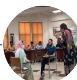
ROLE PLAY ON CBT