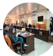
MENTAL HEALTH & DEPRESSION