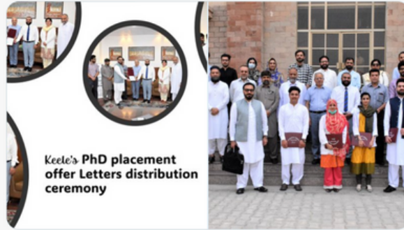
Keele's PhD placement offer Letters distribution ceremony