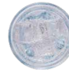
7UP Zero (330ml) £1.15