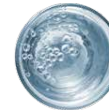
Smart Water (600ml) £1.20