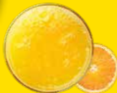
Orange Juice £1.00

Toast x2 (V) (VE) ..... £1.40 with Butter/Flora Add Jam for 40p