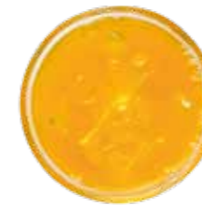
Fanta (330ml) £1.15