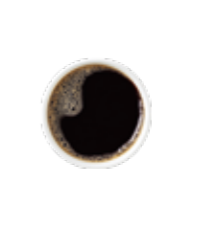
Double Espresso £2.10