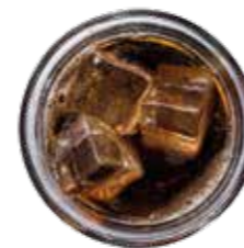
Coca Cola (330ml) £1.25