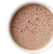
Hot Chocolate £2.75