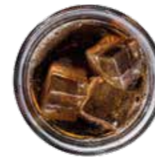
Diet Coke (330ml) £1.15