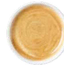
Flat White £2.20