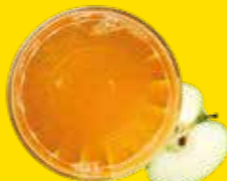
Apple Juice £1.00