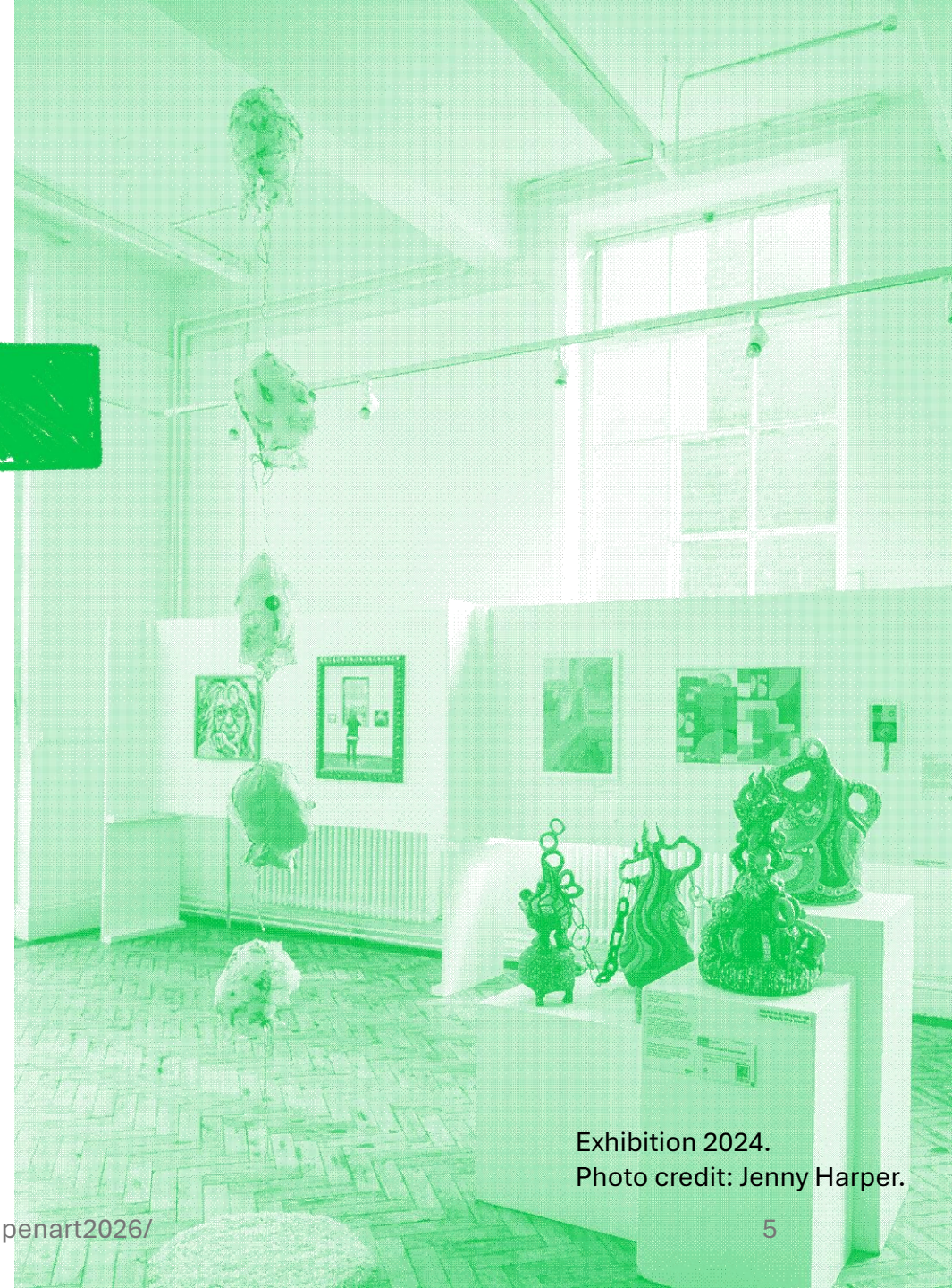
Exhibition 2024.