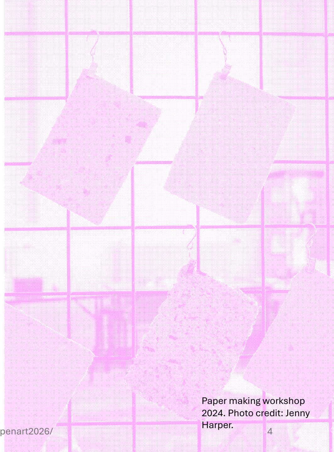
Paper making workshop 2024.