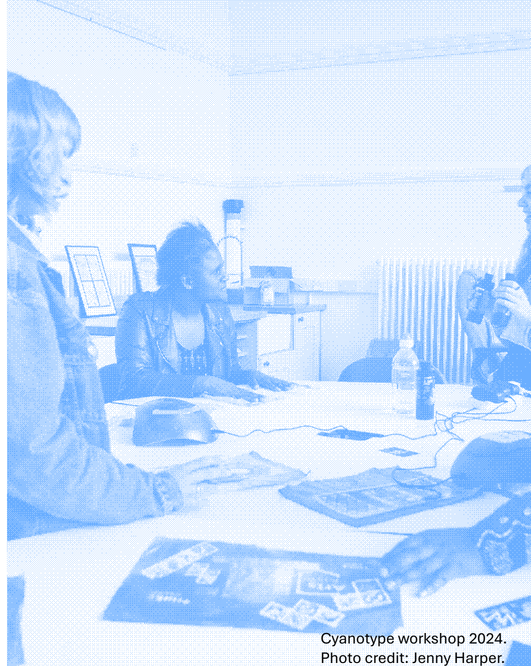
Cyanotype workshop 2024.