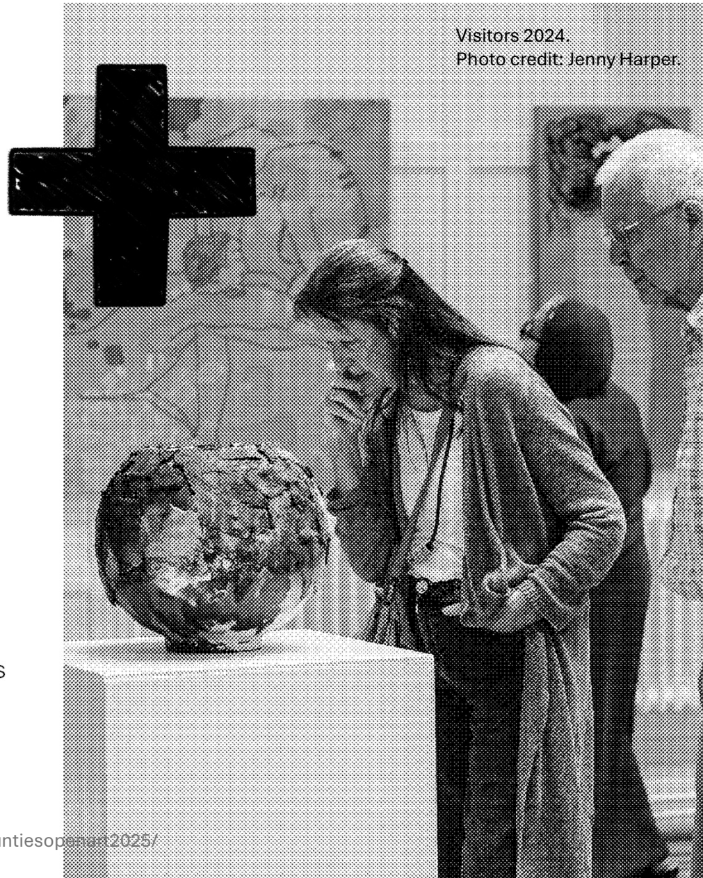
Visitors 2024.

keele.ac.uk/about/artskeele/threecountiesopenart2025/