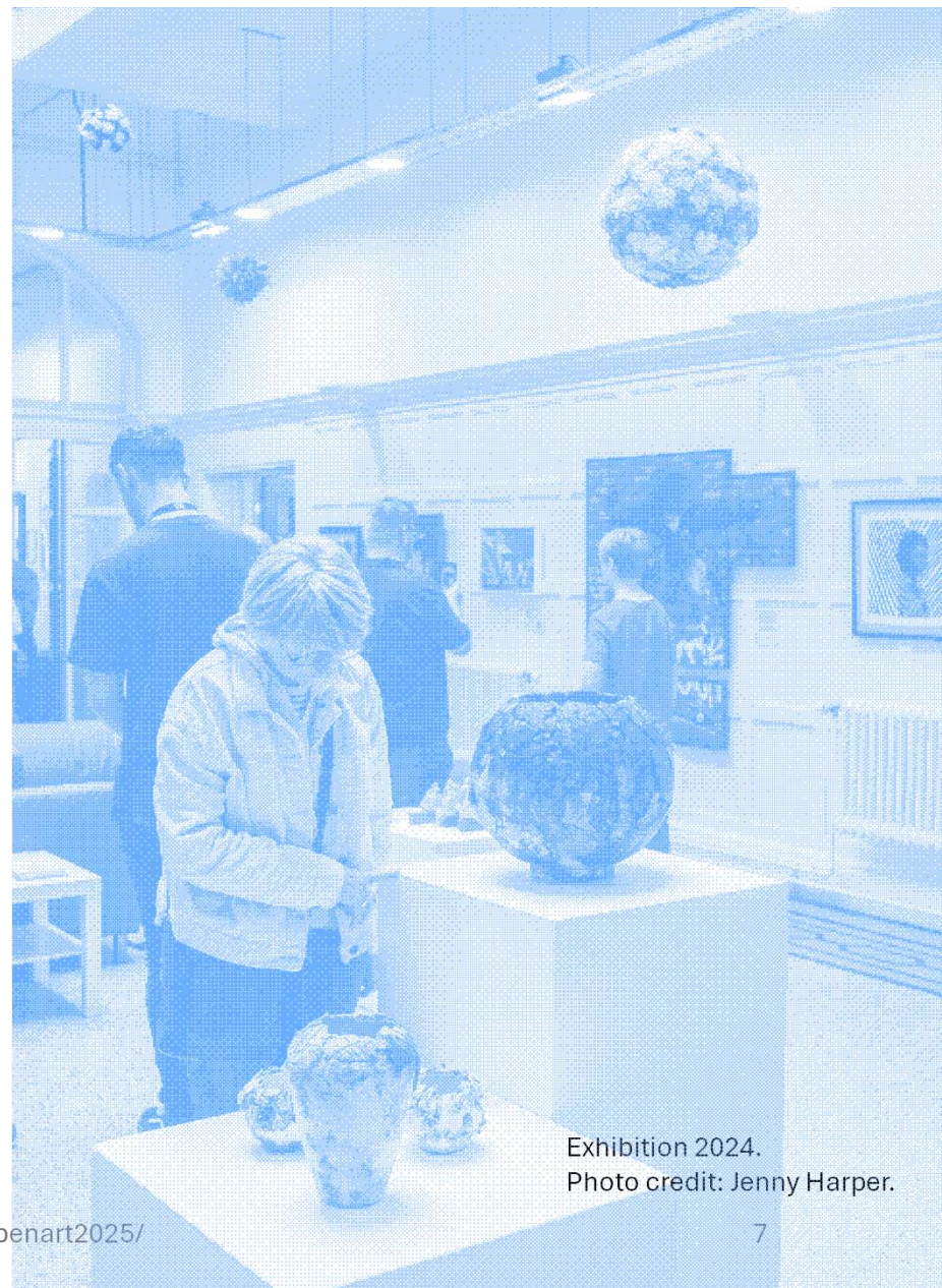
Exhibition 2024.

Learn more: Three Counties Open Art 2025 Follow us: @artskeele on Instagram and Facebook