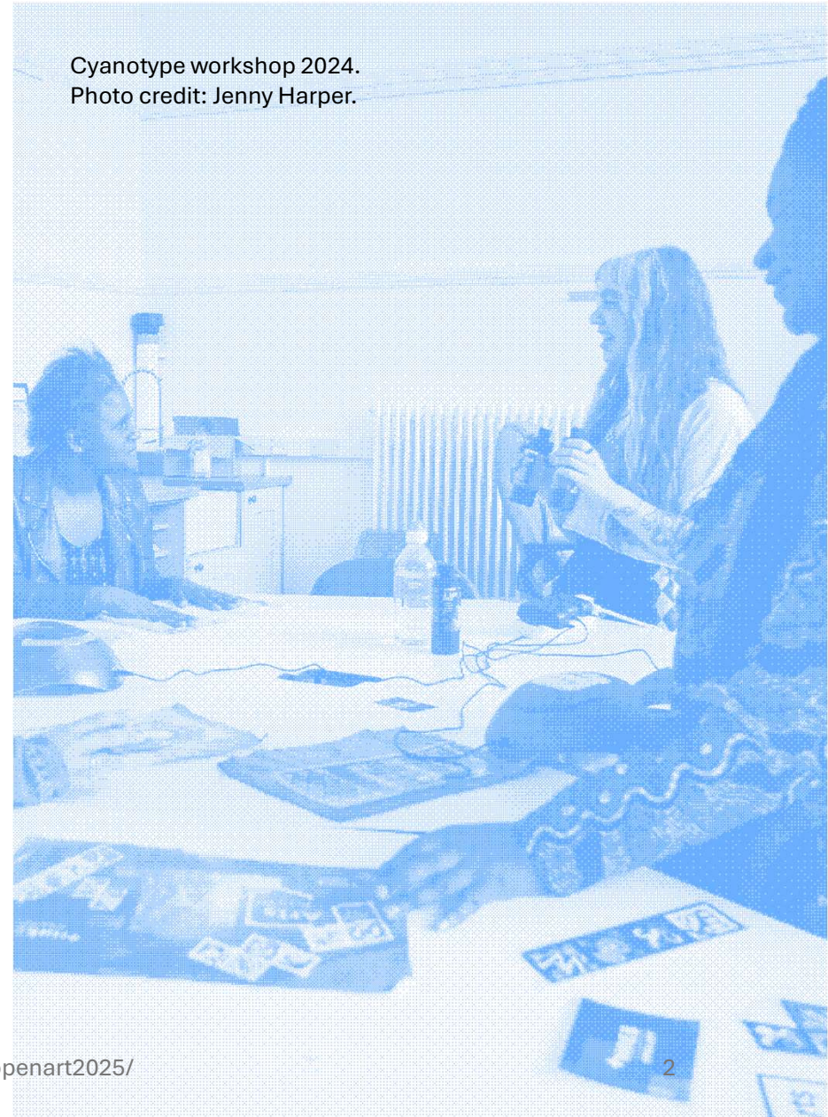
Cyanotype workshop 2024.

keele.ac.uk/about/artskeele/threecountiesopenart2025/