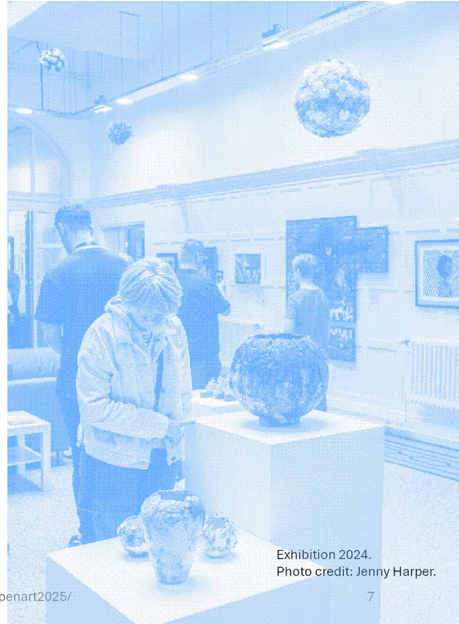
Exhibition 2024.

keele.ac.uk/about/artskeele/threecountiesopenart2025/