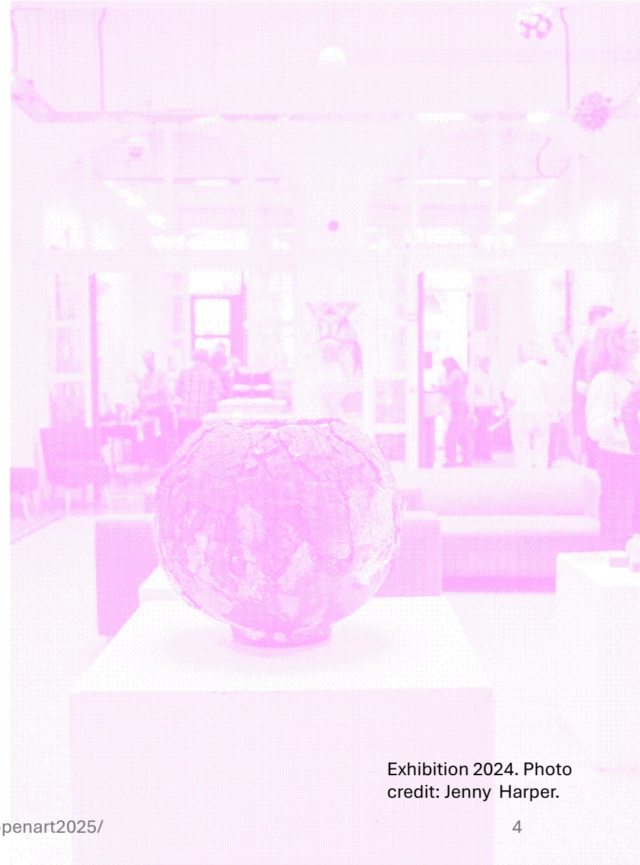
Exhibition 2024.