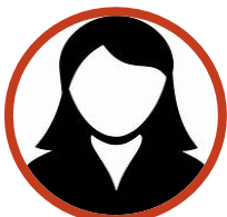
FATIMA RUBY SITE COORDINATOR