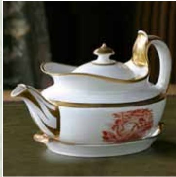
Teapot, Hybrid hard paste porcelain 1805