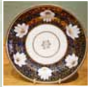
Miles Mason Teawares, Bone China c.1810