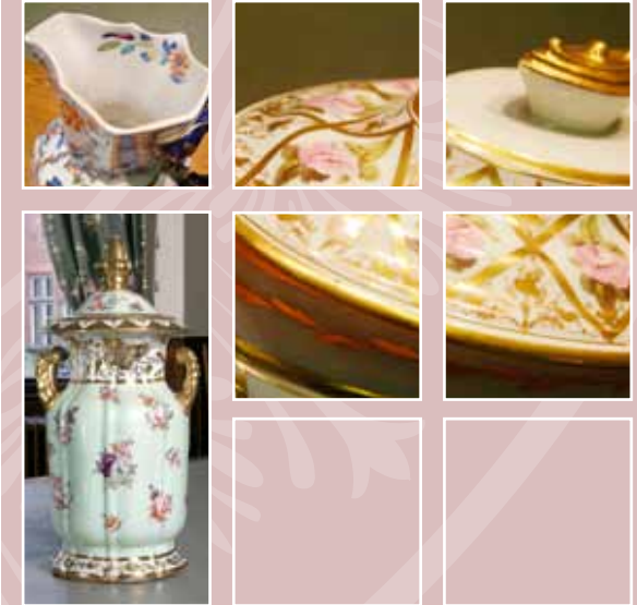
Essence Jar, Ironstone c.1825